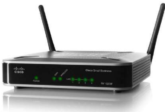
Figure 1. Cisco RV 120W Wireless-N VPN Firewall

The Cisco® RV 120W Wireless-N VPN Firewall combines highly secure connectivity – to the Internet as well as from other locations and remote workers – with a high-speed, 802.11n wireless access point, a 4-port switch, an intuitive, browser-based device manager, and support for the Cisco FindIT Network Discovery Utility, all at a very affordable price. Its combination of high performance, business-class features and top-quality user experience takes basic connectivity to a new level (Figure 1).